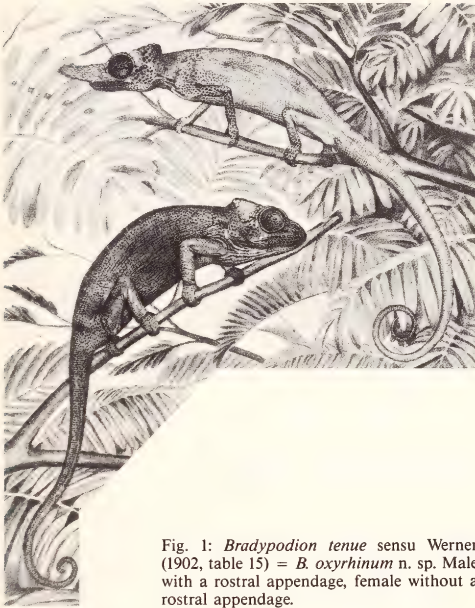
Fig. 1: Bradypodion tenue sensu Werner (1902, table 15) = B. oxyrhinum n. sp. Male with a rostral appendage, female without a rostral appendage.